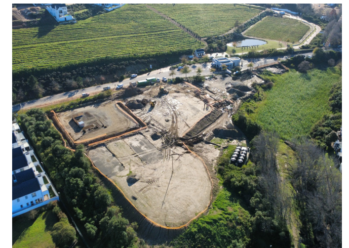
Site preparation and building works in progress at Welgevonden Park